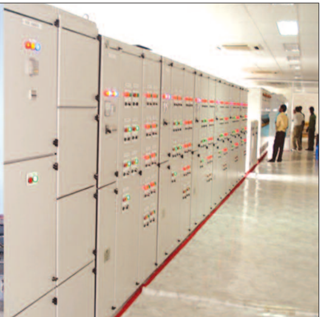
Siddirganj Power Plant