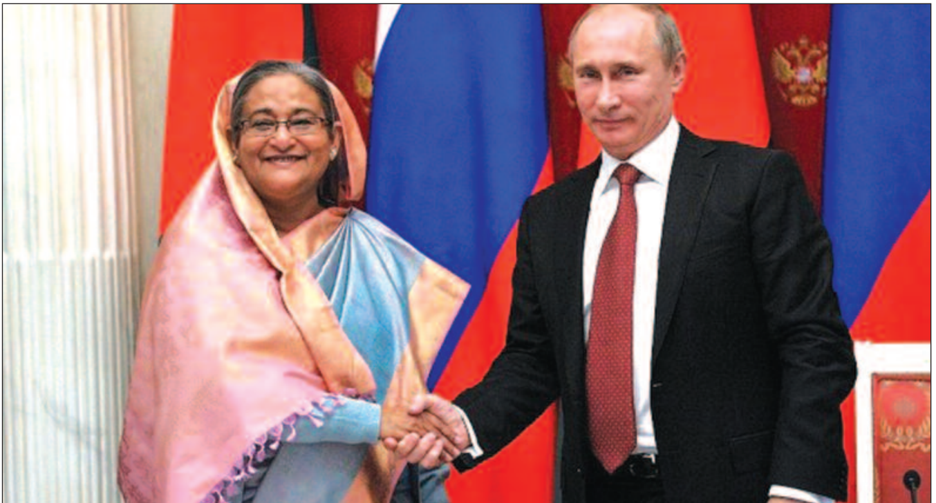
Bangladesh Prime Minister Sheikh Hasina and the Russian Federation President Vladimir Putin.