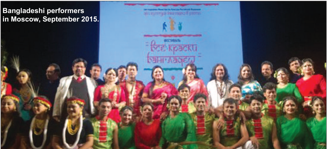
Bangladeshi performers in Moscow, September 2015.