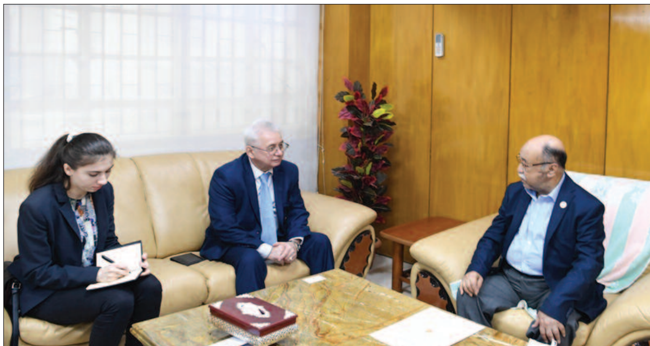
H.E. Ambassador of Russia Mr. Alexander Mantytskiy called on hon'ble Industries Minister Mr. Nurul Mazid Humayun MP on September 8, 2021.

ucts in Russian markets. The country's imports from Russia include cereals, minerals, chemical products, plastic products, metal, machinery and mechanical equipment. Russia can export capital machineries, fresh and dried fruits and raw sugar. Russia is also extending their technical and financial assistance to construct the country's first ever nuclear power plant having capacity of 2x1200 Mega Watt in Rooppur, Pabna, scheduled to be commissioned in 2024.