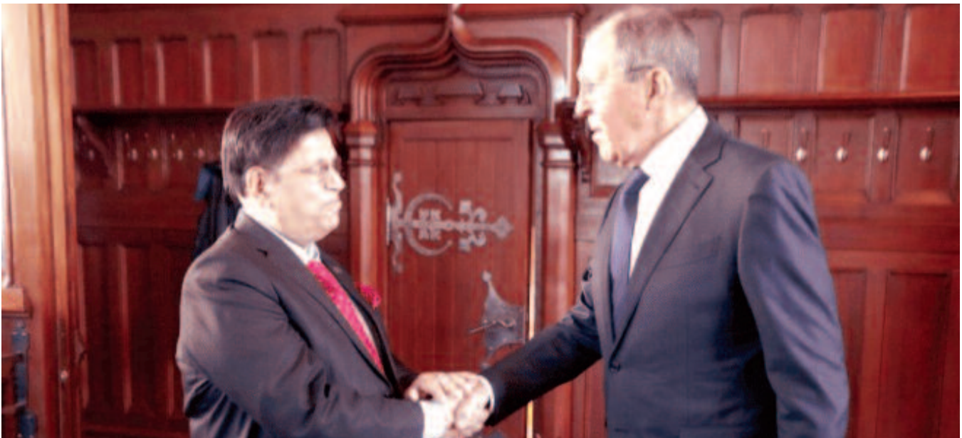
Bangladesh Foreign Minister Dr. A.K. Abdul Momen, MP and the Russian Federation Foreign Minister Mr. Sergey Lavrov.

The Writer is an economic affairs analyst and columnist.