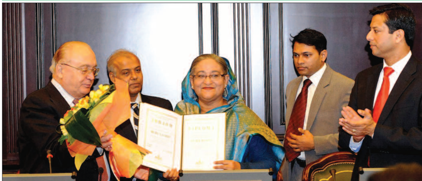
Bangladesh PM Sheikh Hasina Honored with Diploma Certificate from the Moscow State University for her brilliant speech.