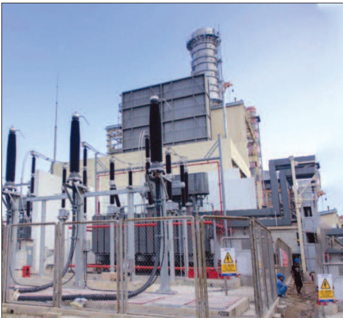
Ghorashal Power Plant