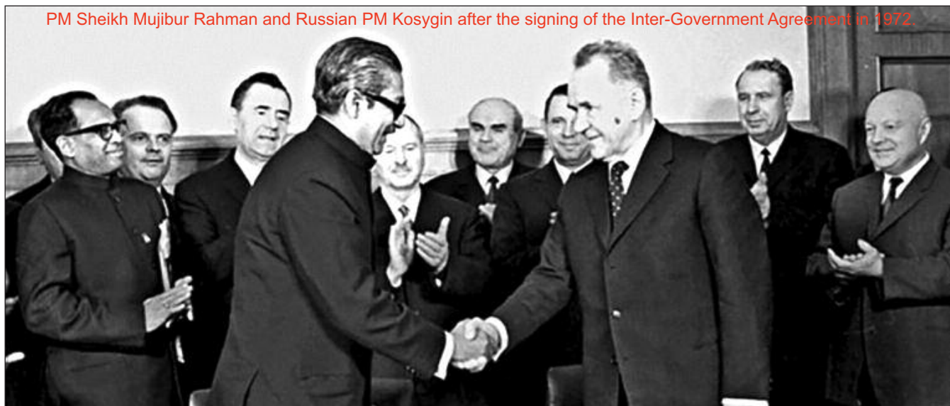
PM Sheikh Mujibur Rahman and Russian PM Kosygin after the signing of the Inter-Government Agreement in 1972.